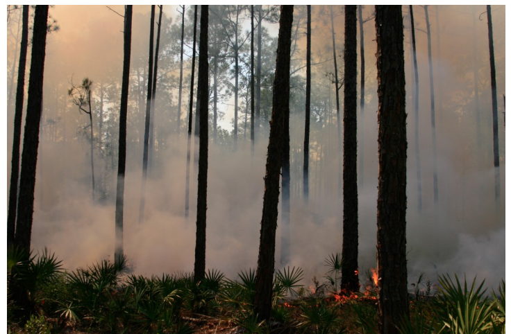
Fuel moisture determines whether ignition will take place and to what depth the forest floor will be consumed.

The forest floor moisture gradient is fairly steep soon after precipitation, which generally is to the burner's advantage, but the curve flattens out within a week or two, especially on sandy soils. When the moisture content of a duff layer (greater than ~1 inch deep) is within about 10% of the litter layer moisture content, it is a good idea to review the burn objectives and