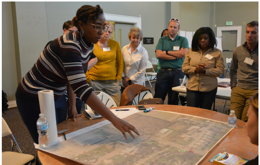
Huntsville representatives participating in the Safe Streets Academy in 2019 along with staff from Pittsburgh, PA and Durham, NC.